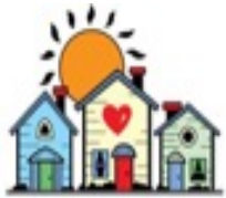
Home Life Groups